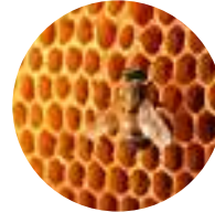
INTEGRATED PLANT PROTECTION